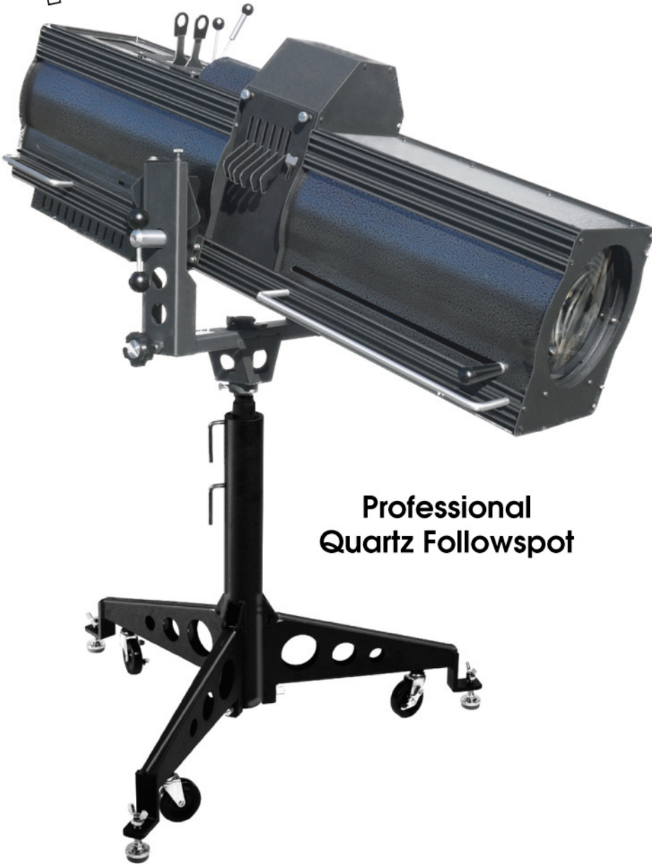
Professional Quartz Followspot

A High Efficiency, 1200 Watt, 80 Volt Lamp followspot. Ideal for HI-DEF Television, 3250°K - no color correction needed. Small enough for Theater Coves or Box Boom positions.